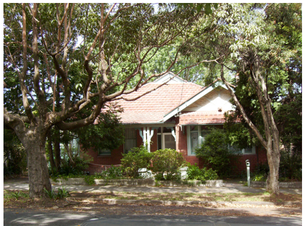
Figure 31. 8. A more modest house, but highly contributory to the Figure 31. 9 local streetscape.