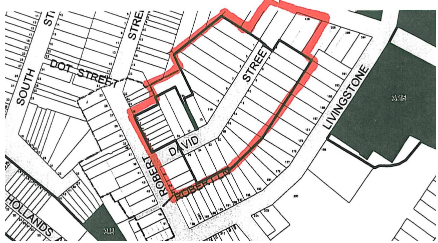
Figure 31.1 HCA 31 – David Street Heritage Conservation Area