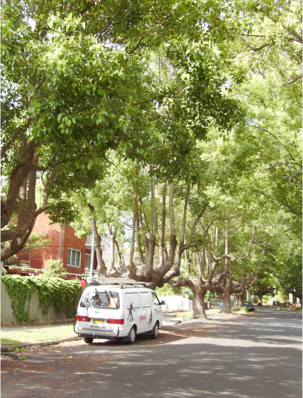
Figure 31.20. The main non-original element within the David Street group is this 1960s red texture-brick residential flat building. Although considerably larger in scale and unsympathetic in form to the original buildings in the area its impacts on the streetscape are ameliorated by the unusually lush growth of the Brush Box trees.