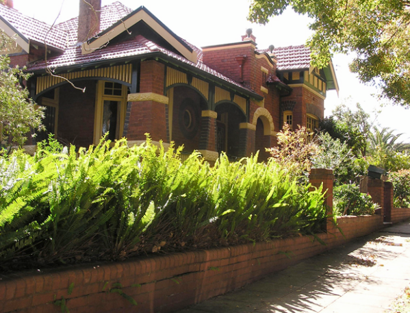
Figure 31.5. The houses to David Street set well back from the street alignment and allow for the planting of a reasonable front garden.