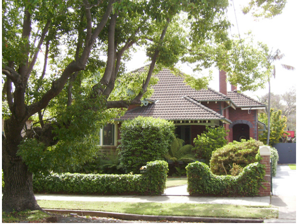
Figure 31.12. Although developed after the Victorian style of architecture had been superseded by the Federation, the Area includes some Victorian style houses.