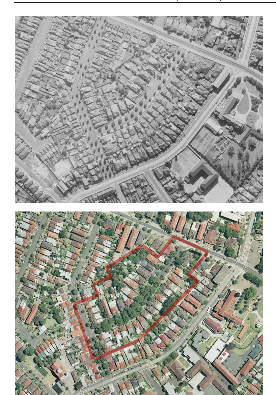
Figure 31.2 The Area in 1943 and 2009 The young street tree plantings can be seen clearly.