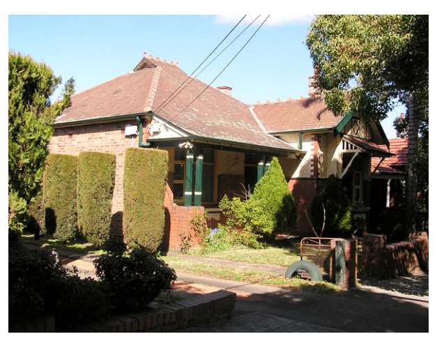
Figure 31.11. Many of the houses in David Street have retained their original slate roofs, which contributes strongly to the aesthetic qualities of the Area..