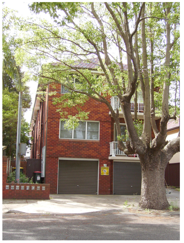
Figure 31.19. Robert Street