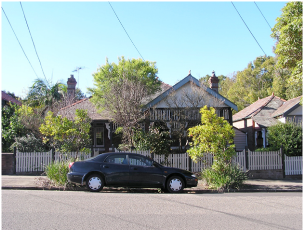
Figure 31.14 the houses within the conservation area in Robert Street contribute to the David Street group through their scale, form and detailing. The street trees also continue along Roberts Street towards Livingstone Road.